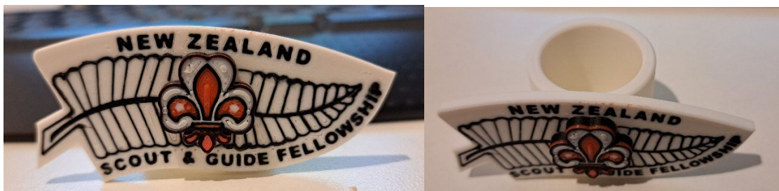
New 3D printed fellowship woggles